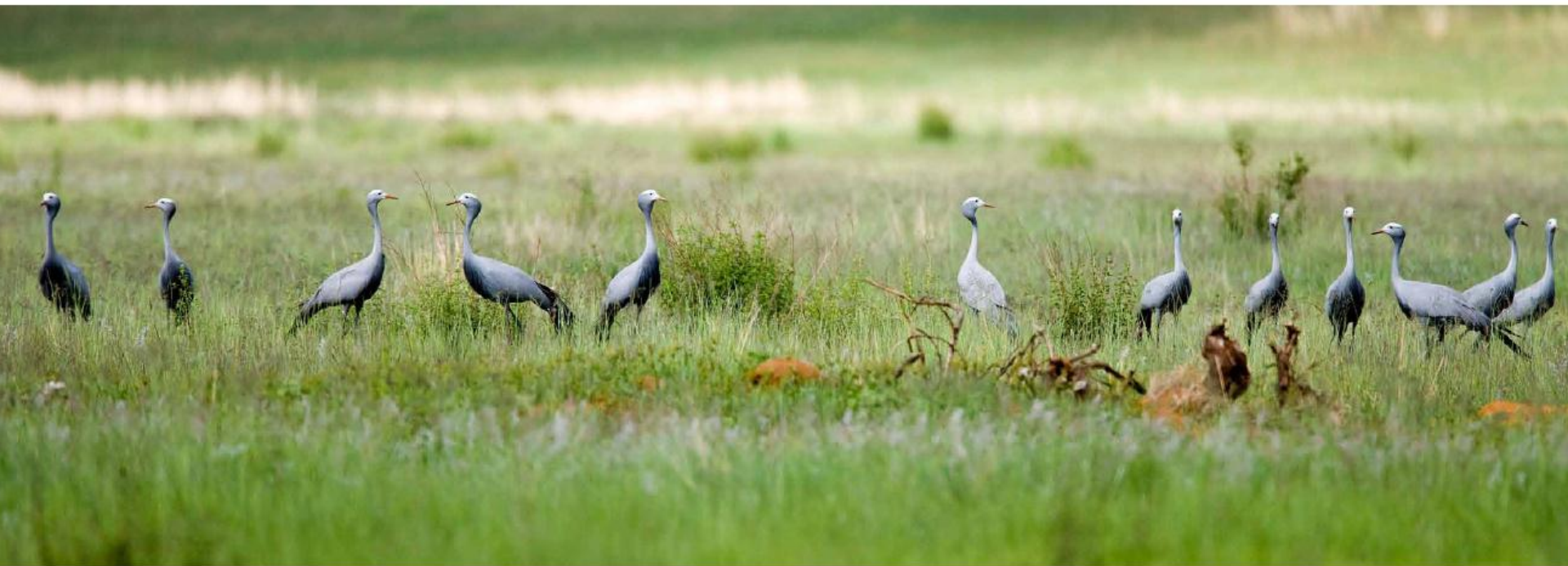
Blue cranes on the southern grasslands