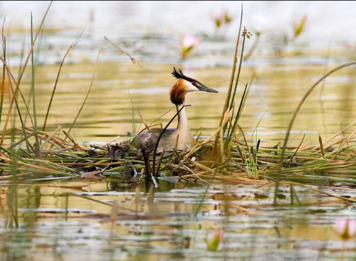
A raft of reeds provides a floating nest for a great crested grebe.