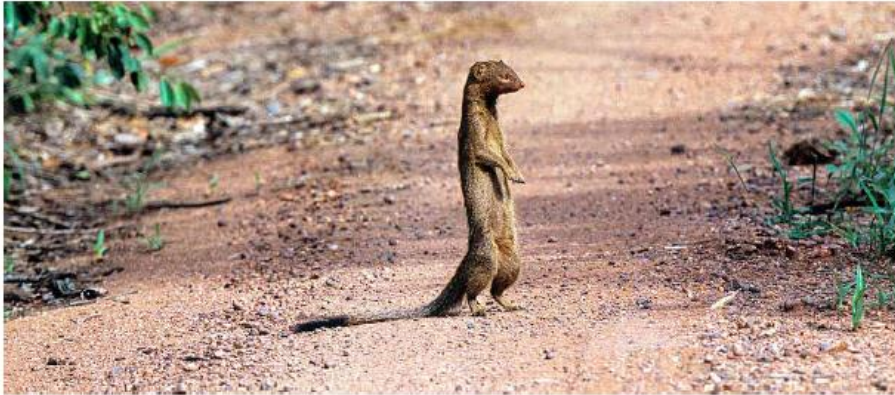
The slender mongoose hunts alone, unlike other mongoose species, and is a highly effective predator.